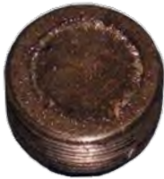
OEM Magnetic Filter Plug