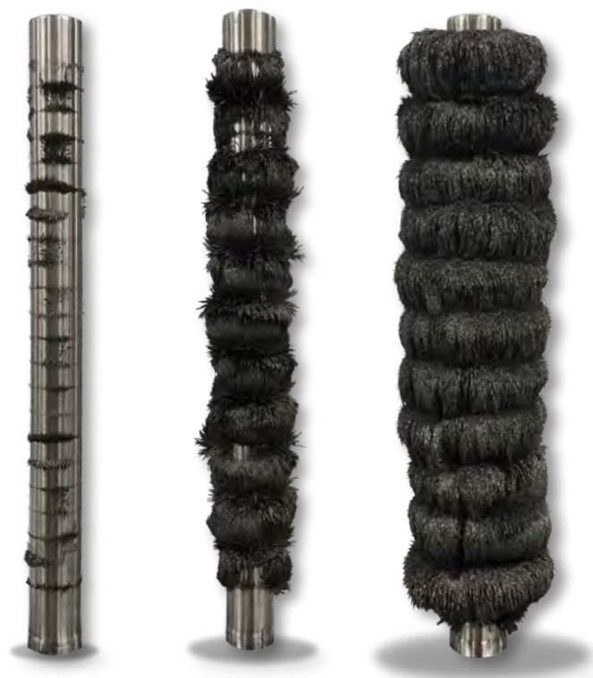
1" magnetic filter elements with varying loads of contamination. Dirt holding capacity*: 3.97 lb-ft.

The patented magnetic filter element attracts ferrous wear particles down to 4 microns and below with up to 95+% efficiency. The magnetic filter element attracts both ferrous and non-ferrous particles. The radial magnetic field design offers incredible holding strength and a high dirt holding capacity. OEI magnetic filter elements are employed in various housings designed with calculated dwell times for optimal filtration. Magnetic filter elements come in five sizes from 1/2" to 2" outer diameter (OD) (shown below).