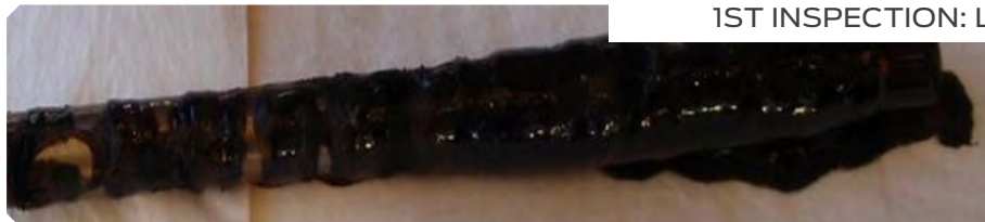
1ST INSPECTION: LEFT