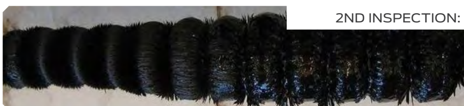
2ND INSPECTION: RIGHT