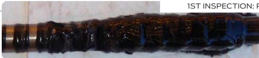
1ST INSPECTION: RIGHT