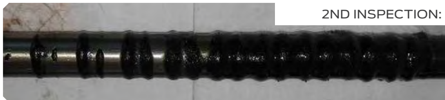
2ND INSPECTION: LEFT