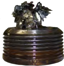
OEI Magnetic Filter Plug