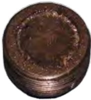
OEM Magnetic Filter Plug